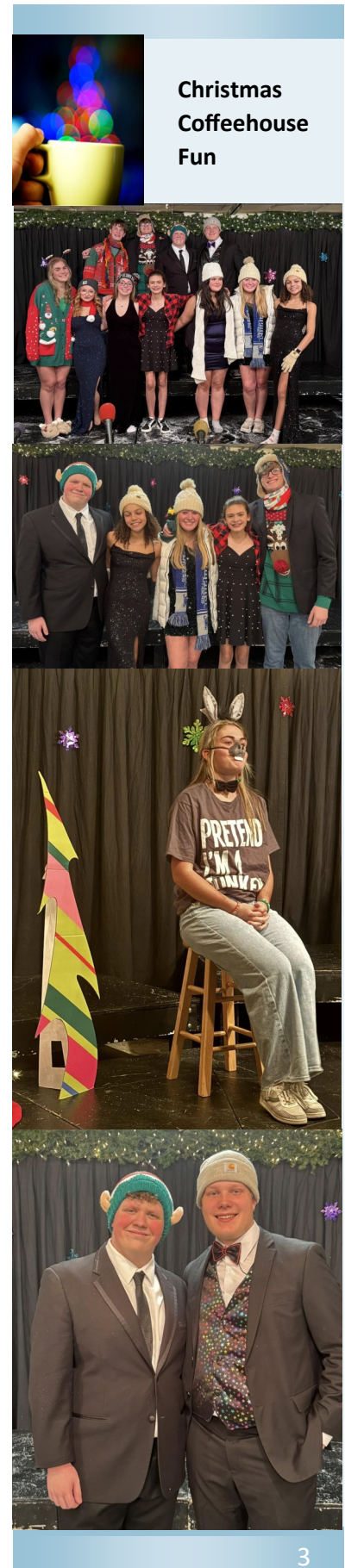
Christmas Coffeehouse Fun